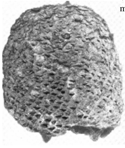
Cycadeoidea marylandica , fossilized stem of a cycadeoid, Maryland, Jurassic thru Cretaceous

With so many gaps in the fossil record it is possible that major families of the Cycadales that were once quite common remain completely unknown. The curious genus Pterosoma known only from Lower Eocene fossils found near Victoria, Australia, is another example. It possessed forked veins in its leaves, like the Stangeriaceae and must have been widespread in southern Australia during the Cretaceous.