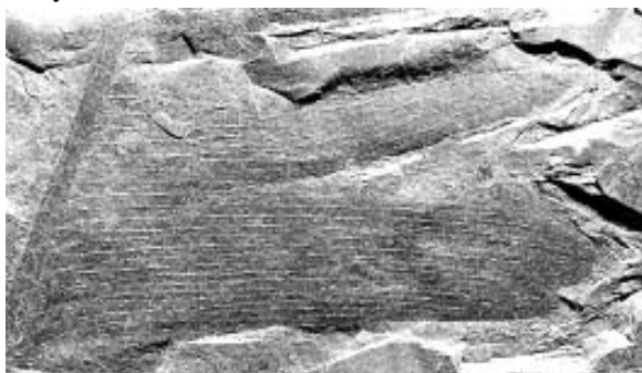
Closeup of leaflets showing the broad connection to the rachis. Note how the veins divide as they leave the rachis.

the loose megasporophyll design of Cycas and the tight closed cone design of the Zamiaceae. The cones of some of these cycads hung down from the leaf apex like pendulous fruit. While another of that same time ( Pseudoctenis lanei ) was quite similar in form to the modern Encephalartos , having a massive and compact male cone (named Androstrobus manis ) and regularly pinnate leaves with parallel venation in the leaflets, enough that if further discoveries bear out these similarities the cycad may be classified within this genus. This would provide evidence for at least one of the early home ranges of Encephalartos , and indicate the antiquity of its origins. Another fossil cone, Androstrobus zamioides , from the Middle Jurassic sediments of North Yorkshire may be a Stangeria relative. Another Stangeria -like fossil from Argentina suggests that this monotypic and isolated Africa cycad originated in South America and was once global in range. The leaves of the newly discovered genus Chigua from Columbia are strikingly similar to the forked venation, serrated leaf edges, and strong midrib of Stangeria . Could this rare and relict genus be a surviving fragment of Stangeria in the New World?