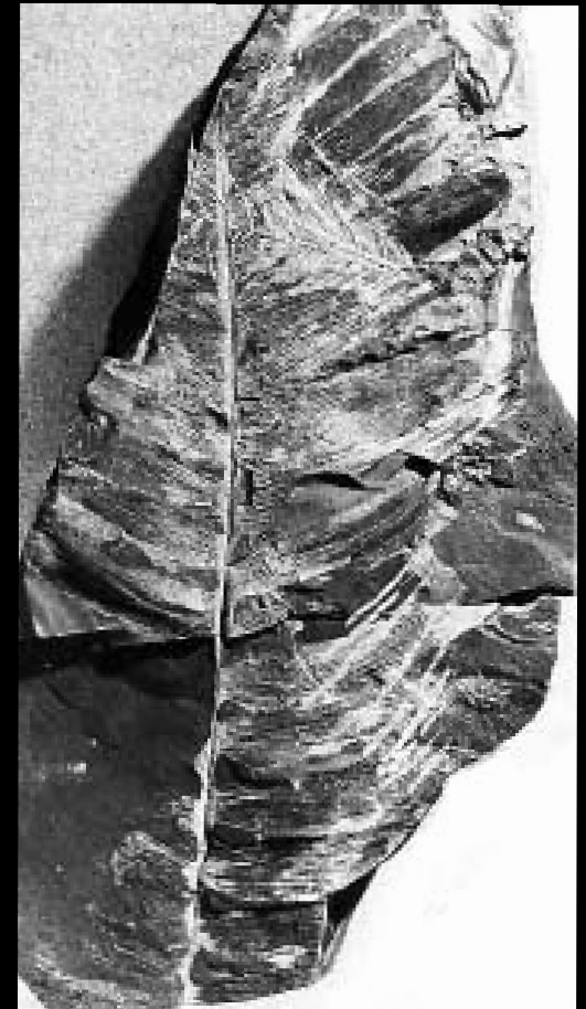
Pseudoctenis spatula world-wide, Jurassic