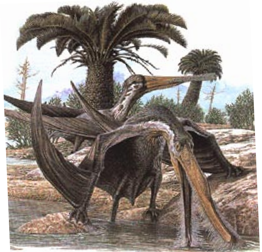
Pseudoctenis lanei -type Cycadale with a striking similarity to the modern Encephalartos , Middle Jurassic.

The leaves of Ctenis were also similar to modern cycads. The broad rachis had compound leaflets attached along it. Some fossils have been found of leaves measuring six feet in length. The parallel venation in Ctenis had occasional cross connections. Ctenis was distributed all across the Jurassic landmass and so far fossils have been assigned to approximately 50 species.