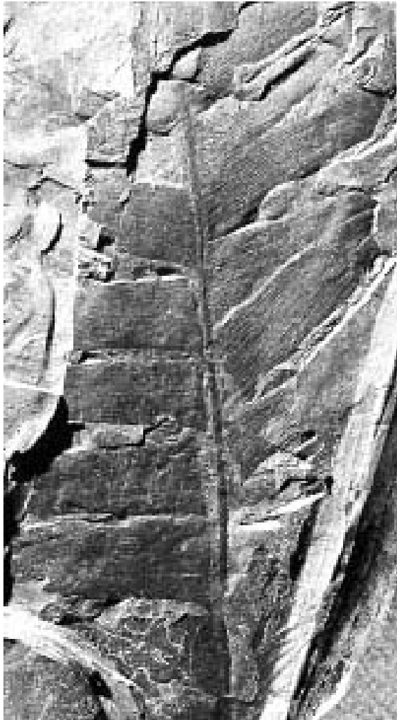
Ctenis biloba A Cycadale, Jurassic