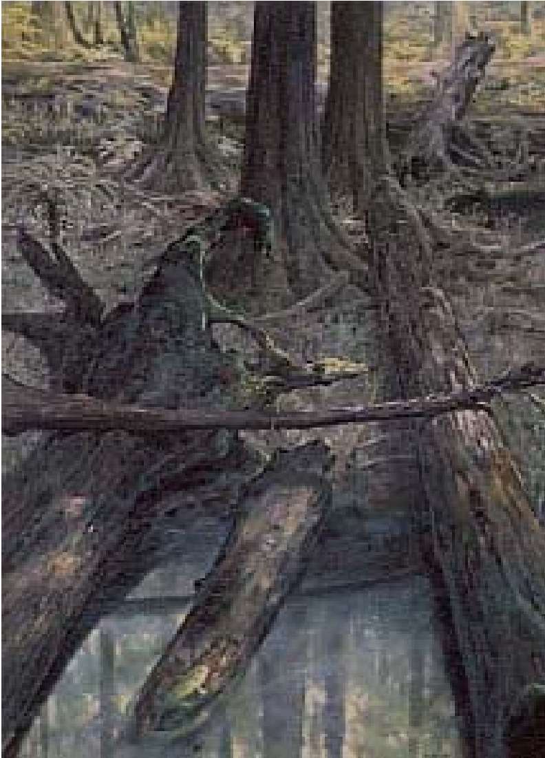
Ichthyostega , an early adventurer onto land in the first forests. Devonian Period

This publication has been prepared and donated to the Palm and Cycad Society of Florida , http://www.plantapalm.com as an overview of the fossil record of the Cycadales and is for informational purposes only.